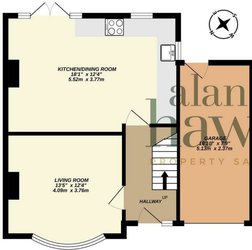
GROUND FLOOR 541 sq.ft. (50.2 sq.m.) approx.